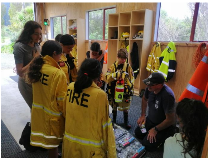
Youth Group visit to the fire station 2023