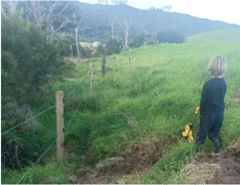
Young helper measuring new fencing